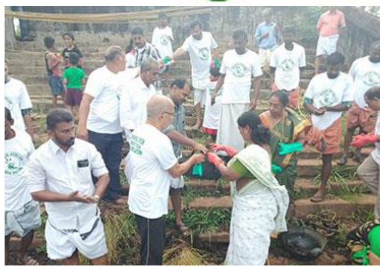
Stage 2 - Collapsed retaining walls, measuring 120 mtrs & 50 mtrs were to be reconstructed. Before local people & trust members embarked on this step, lots of thick vegetation that had grown had to be removed for which machinery was used. Once the vegetation was removed, the fallen stones were taken out & a fresh foundation, measuring approx. 8ft was laid. Random rubble method was used so that unnecessary cement & sand was saved.