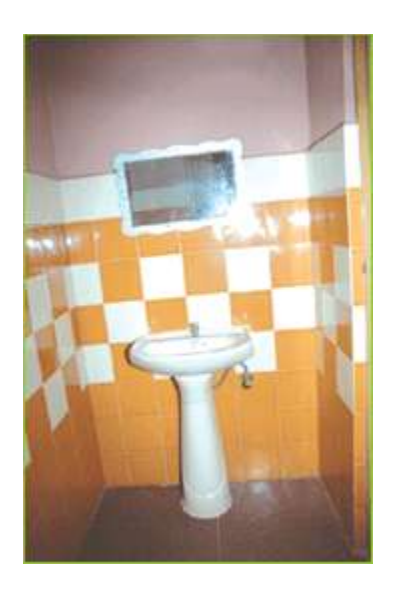
Healthy school initiative