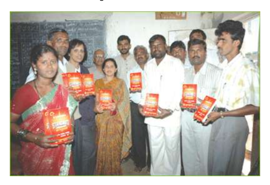
Dictionaries Distribution at Gokula Education Society

Healthy schools initiative has been successfully inaugurated at Dombaranahalli, Hullekere, & Gollarahatti villages of tumkur district.