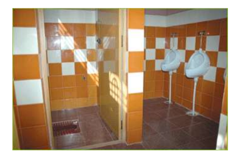
Healthy schools initiative - toilet blocks interior