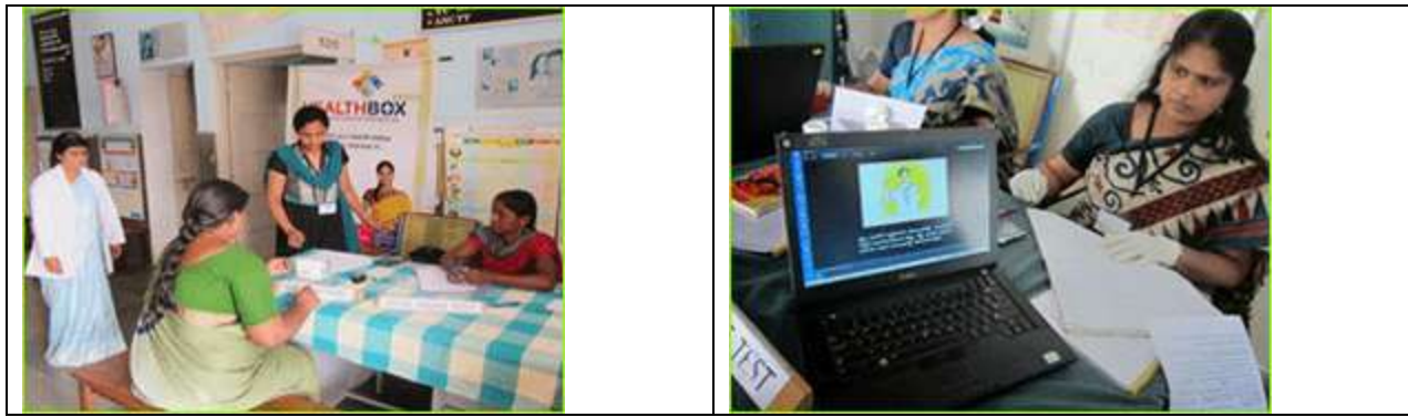
Medical camp: with Health Box, Bangalore Location: 1: BBMP Center, Murphy Town, Bangalore