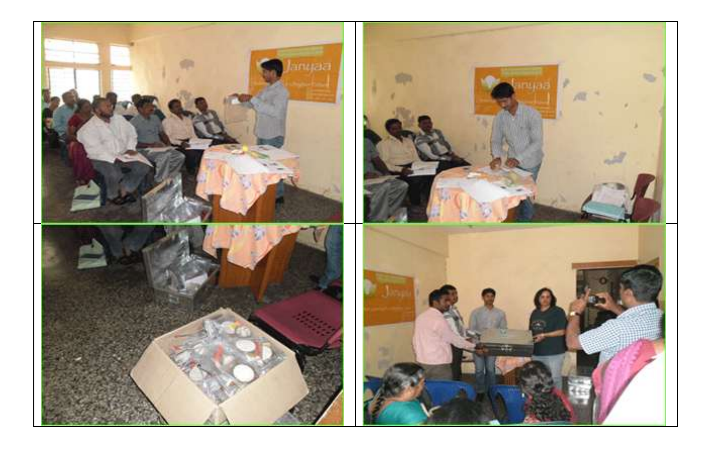
Training Programme & Kit distribution – Kerala