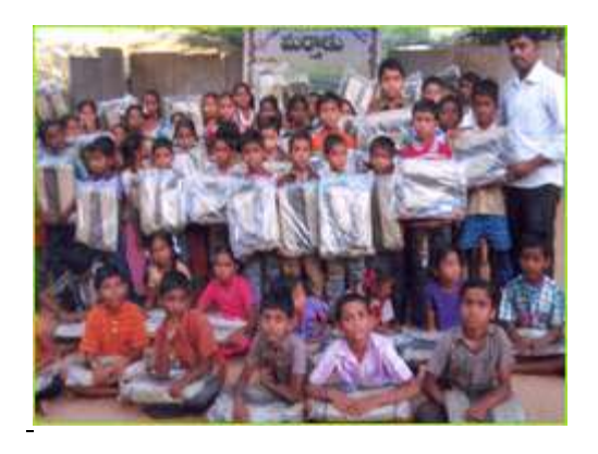
Bags Distribution Marthadu